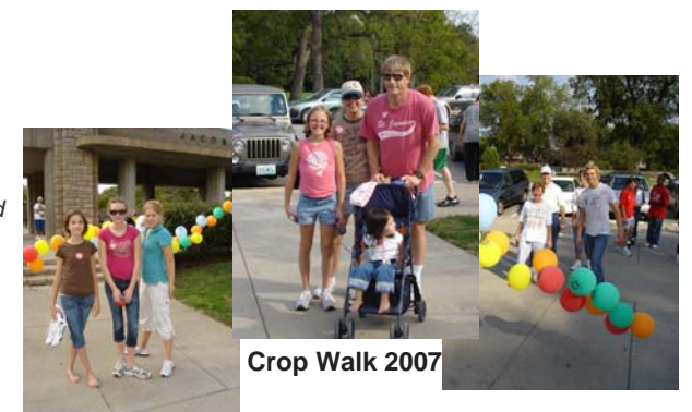
Crop Walk 2007