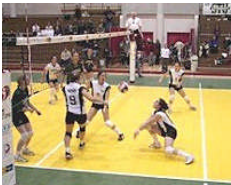
St. James High

School Students will meet at Saint James at 9:47 pm to car pool to the Tomahawk Sports Dome (17501 Midland Drive, Shawnee,