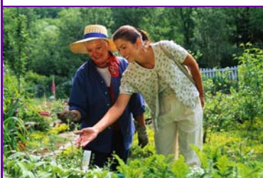
(Continued from page 1)

nesota brats that can be found in Missouri.